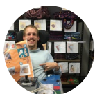
Avenue Order Fulfilment