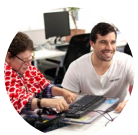
Avenue Hub Management